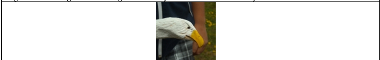
Figure 3: Talking stick carvings created by urban and on reserve youth around Charlottetown

Another youth offered, that his stick could be used to talk about “more than HIV,” but said that he would always connect it with HIV when he looked at it because of the context of where it was created.