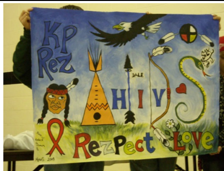
Figure 2: “Rezpect” Mural created by Kettle and Stony Point & Aamjiwnaang First Nations Youth

In contrast to the other two pieces discussed, this mural addressed HIV very directly and employed traditional symbols and notions about what it means to be Indigenous. However, rather than focus on the negative, the mural used positive symbols of Indigenous strength and healing to challenge stigma.