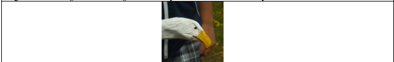
Figure 3: Talking stick carvings created by urban and on reserve youth around Charlottetown

Another youth offered, that his stick could be used to talk about “more than HIV,” but said that he would always connect it with HIV when he looked at it because of the context of where it was created.